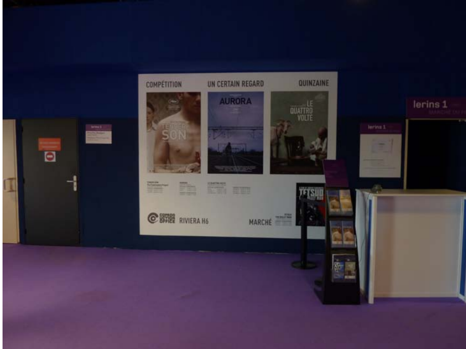
Lerins Screening Room Marché du Film